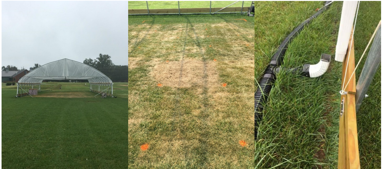
THE GRIFFIN, GA SITE...NOTE MOVEMENT OF SHELTER FROM GUTTER (RIGHT) BY HURRICANE IRMA