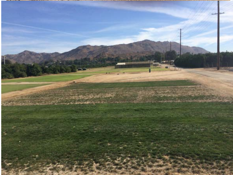
RIVERSIDE, CA - TOP LEFT 60% ETo, TOP RIGHT 40% ETo, BOTTOM - TRIAL OVERALL