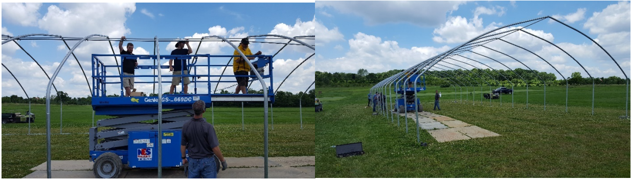
SHELTER CONSTRUCTION AT THE UNIVERSITY OF MARYLAND, COLLEGE PARK, MD