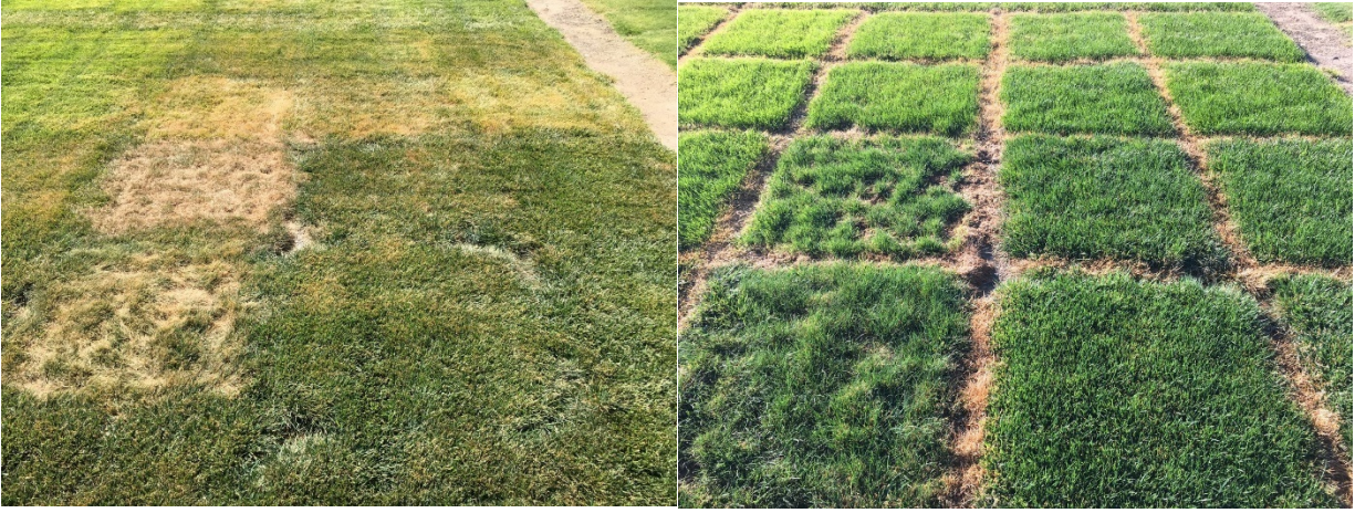
LAS CRUCES, NM – 60% ETo TREATMENT (L), RECOVERY AFTER 100% ETo IRRIGATION (R)