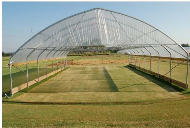
Rainout shelters similar to this will be built and installed at five locations (see map)